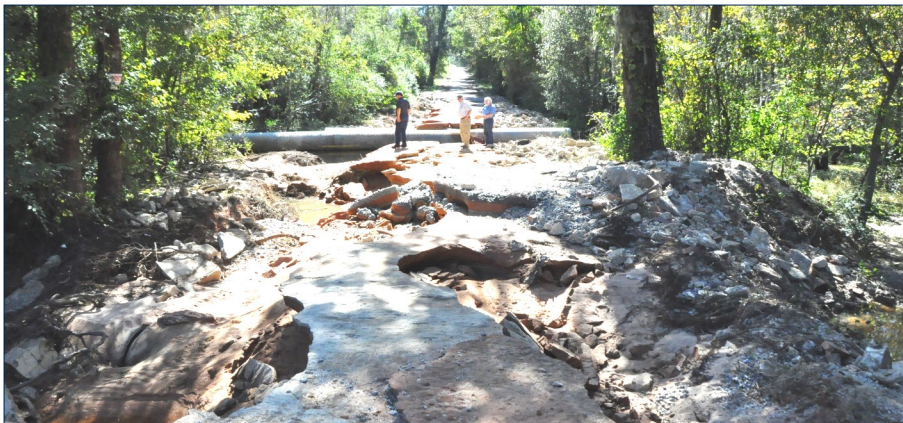
SCEMD recovery specialists conduct a site visit in Florence County to inspect damage caused by Hurricane Matthew.

SCEMD continues coordination with all disaster recovery partners in support of local recovery efforts for residents, local governments and private organizations to ensure that all recovery aid is available to everyone who is eligible throughout the state. The SCEMD Recovery Section began operations well before Hurricane Matthew's landfall by coordinating the disaster declaration process and providing necessary documentation to all counties statewide. SCEMD's private sector group processed more than 1,000 business requests for post-disaster reentry and provided daily updates to over 1100 commercial entities throughout the activation, response, and initial stages of recovery. Immediately following the storm, SCEMD deployed six damage assessment teams to survey the entire state and assist county emergency managers in determining eligibility for federal disaster recovery programs.