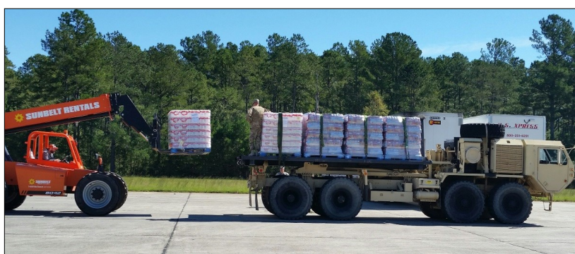
Relief supplies being loaded onto a National Guard vehicle at the SCEMD staging area in North, S.C.