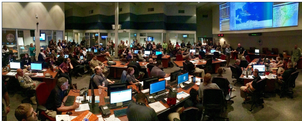
South Carolina's State Emergency Operations Center fully activated by all agencies during the response to Hurricane Matthew.

Coordination efforts during this time included twice-daily conference calls with all of the state's county emergency managers and state emergency support function staff. As the storm approached a point where large evacuation support functions were necessary, twice-daily conference calls with the Governor and select agency heads comprising the executive group were also conducted. As the storm arrived, FEMA headquarters conducted video teleconferences daily, and after the storm passed, U.S. Congressional conference calls were conducted daily.