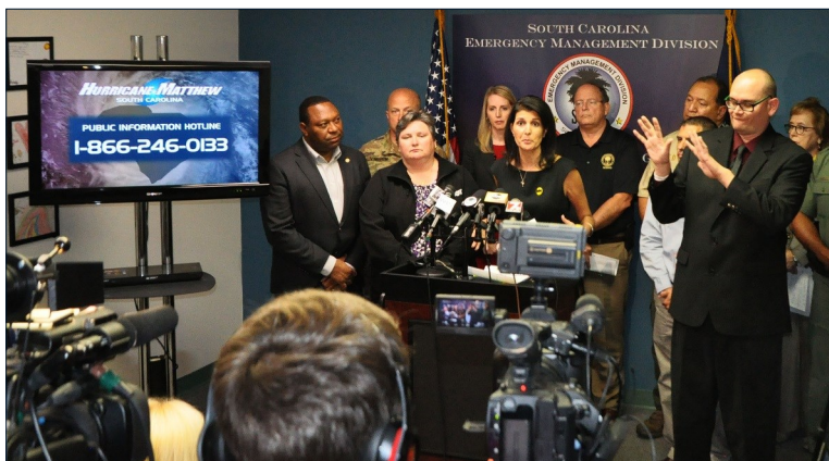
Governor Nikki Haley and agency leaders conducted ten emergency news conferences from the state Emergency Operations Center.

During the approach of Hurricane Matthew and in its aftermath, the state's emergency public information team maintained continuous engagement with residents through all multimedia resources available. In coordination with the Adjutant General's Office, the Governor's Office, the Federal Emergency Management Agency, and local governments, state public information officers coordinated media availabilities, published more than 66 media advisories, news releases and fact sheets to date.